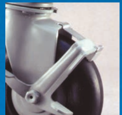
Custom finishes available including a rainbow of powder coat colours