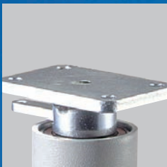
Multi purpose system. 3 positions – free swivel, swivel lock and total lock