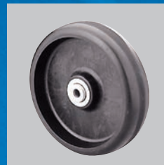
Neoprene Easy rolling and swiveling under full load