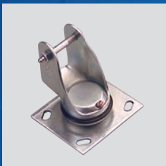
Sealed, grease-able assemblies for wash down applications

Darcor manufactures a complete line of high-quality, ergonomically designed products that meet high standards in strength, reliability and longevity.