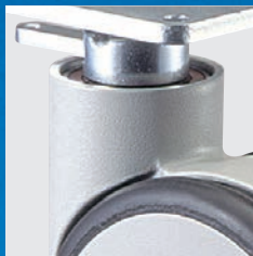
Cast aluminum yoke – high load capacity in a modern, light weight, design